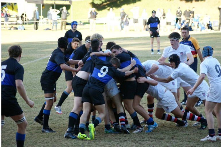
Knox forwards hold up the maul for a penalty